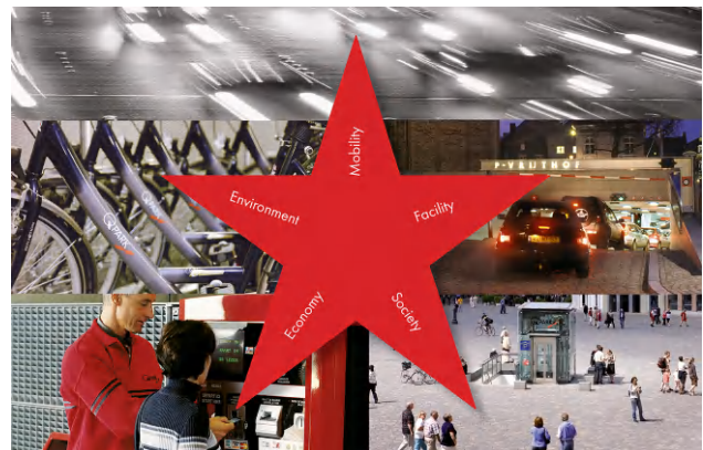
Quintessence - The logic of regulated and paid parking

Our Quintessence is to guide those who are interested along the way of understanding 'the logic of regulated and paid parking'. As a mnemonic, Quintessence is illustrated as a five point guiding star, where each point in itself is a good reason to regulate or pay for parking.