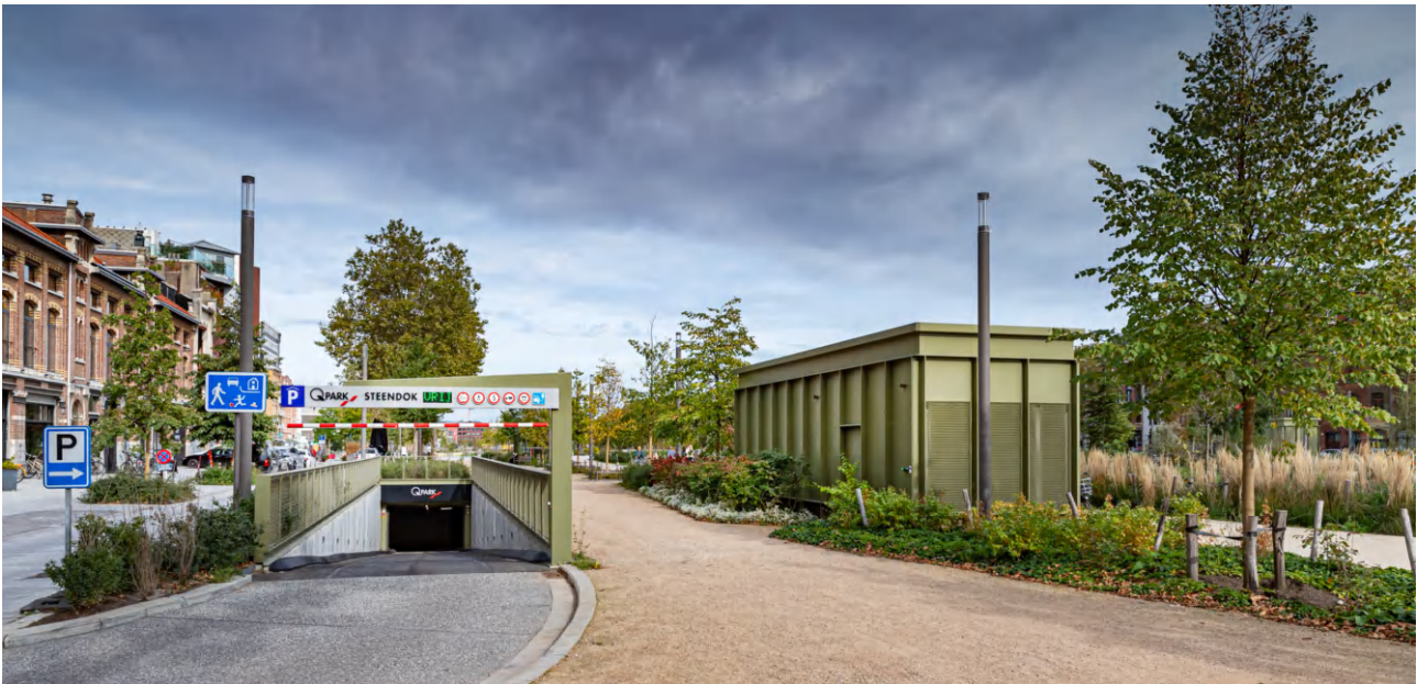
People above ground - cars and bicycles under ground